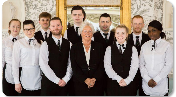
Example 'Welcome' Photograph

Consider having at least one image for each of the sections within the Checklist